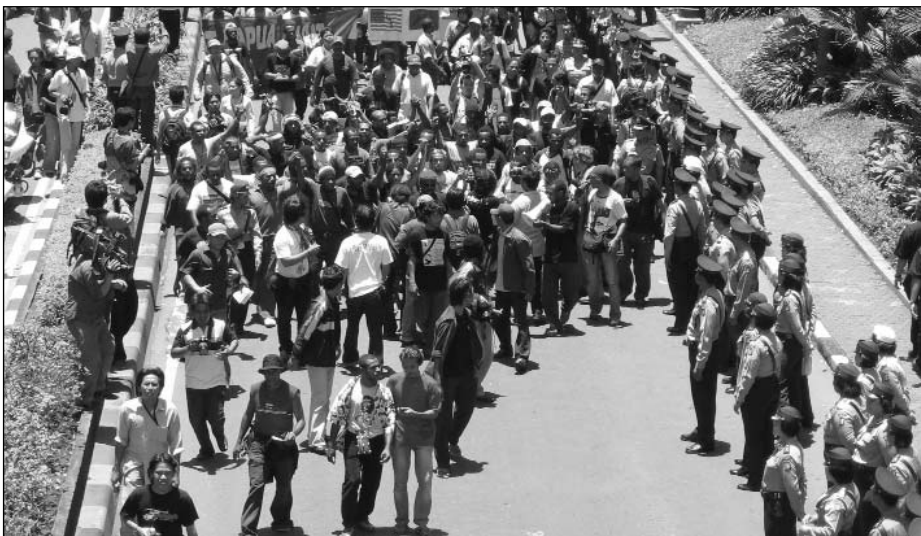
Demonstration against Indonesia's biggest investor, Freeport-Rio Tinto, Jakarta 2006 (Igor O'Neill)

(Source: Indonesia Matters , 26/Jan/07; Detikfinance 24/Jan/07; http://www.indonesiamatters.com/1066/2006-fdi/ accessed 8/5/07; http://www.britishembassy.gov.uk/ , accessed 21/Mar/07.)