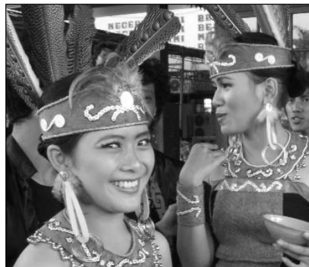
Dayak hosts welcome participants

One of the preparatory steps for KMAN III was to set up a small team to review AMAN's statutes. This drafted a new organisational structure and modus operandi which was presented at the final meeting of the 2003-7 AMAN Council, held the day before KMAN III started.