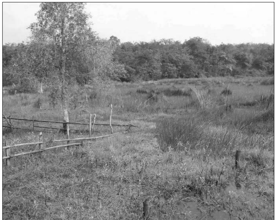
Talang Nangka village land: oil palm threatens sonor rice.