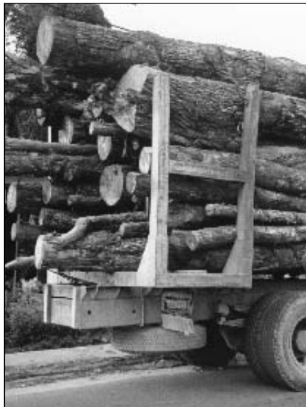
Legal? Logs in North Sumatra (DTE)

The members of the multi-stakeholder working group on the legality standard (known in Indonesia as the tim kecil )* identified several key issues which needed to be followed up once the legality standard had been completed. These concern the institutions, mechanisms and procedures required for verifying timber legality, as well as for publishing the results of verifications. These issues were also raised at a public consultation held in Jakarta in January. It was agreed by the participants that the institution