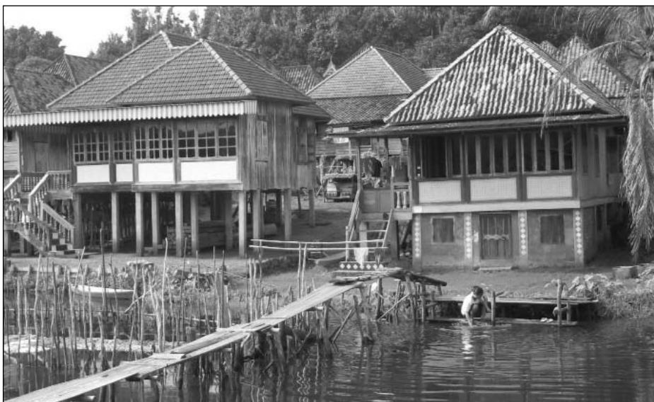
Talang Nangka village, South Sumatra

For further background see DTE 72:1-3 and DTE 71: 5-9. Sawit Watch's two 2006 reports, Promised Land: Palm Oil and Land Acquisition in Indonesia , and Ghosts on our own land: oil palm smallholders in Indonesia and the Roundtable on Sustainable Palm Oil , are available in English and Indonesian from www.sawitwatch.or.id and www.forestpeoples.org .