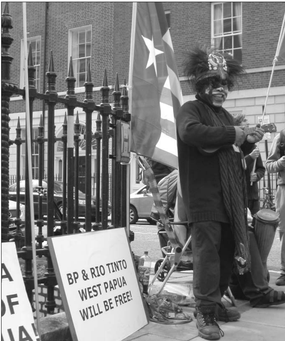
Papuan activists boycott the London TIAP meeting, April 2007

BP has a programme to manage the local Sousa dolphin population and other marine mammals and is working with environmental organisations such as WWF and Conservation International, but it is unclear if these programmes will be effective or how they will integrate with the LNG facility. Indeed BP's Biodiversity Action Plan contains much that focuses on conservation, surveys and education, but not so much on the practicalities of reducing Tangguh's environmental impact. There is a legitimate concern that, if the monitoring is left in-house, Bintuni Bay may suffer a similar fate as Prudhoe Bay in Alaska, but without the infrastructure available to respond effectively.