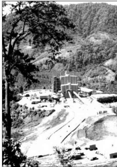
Newmont's mine, North Sulawesi

Newmont's approach has been to deny any link between its operations and the health impacts - pointing the finger at the use of mercury by unlicensed mining operations in an adjacent, but separate catchment area to